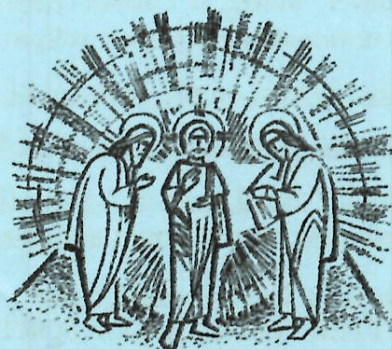
His face shone like the Sun

Lent is a Season of preparation for the whole Paschal Triduum Maundy Thursday, Good Friday and Easter Sunday: not just a time to reflect on the Cross. Often our Lenten devotions can focus exclusively on the Cross, and the idea of Baptism can be lost. This is why the Church invites us to join the disciples in looking beyond the cross this Sunday: we see the glory of Easter, the glory of the resurrection and the glory of the baptised. We see all this in the Transfiguration: we are invited to recognise who Jesus is. It is the glorified Jesus, whom we will celebrate at Easter, who calls us to journey through Lent, just as God called Abram to journey far from his home. So the readings lead to us acknowledge that Lent is a very special calling, to follow the Lord of glory to the renewal of baptismal purity.